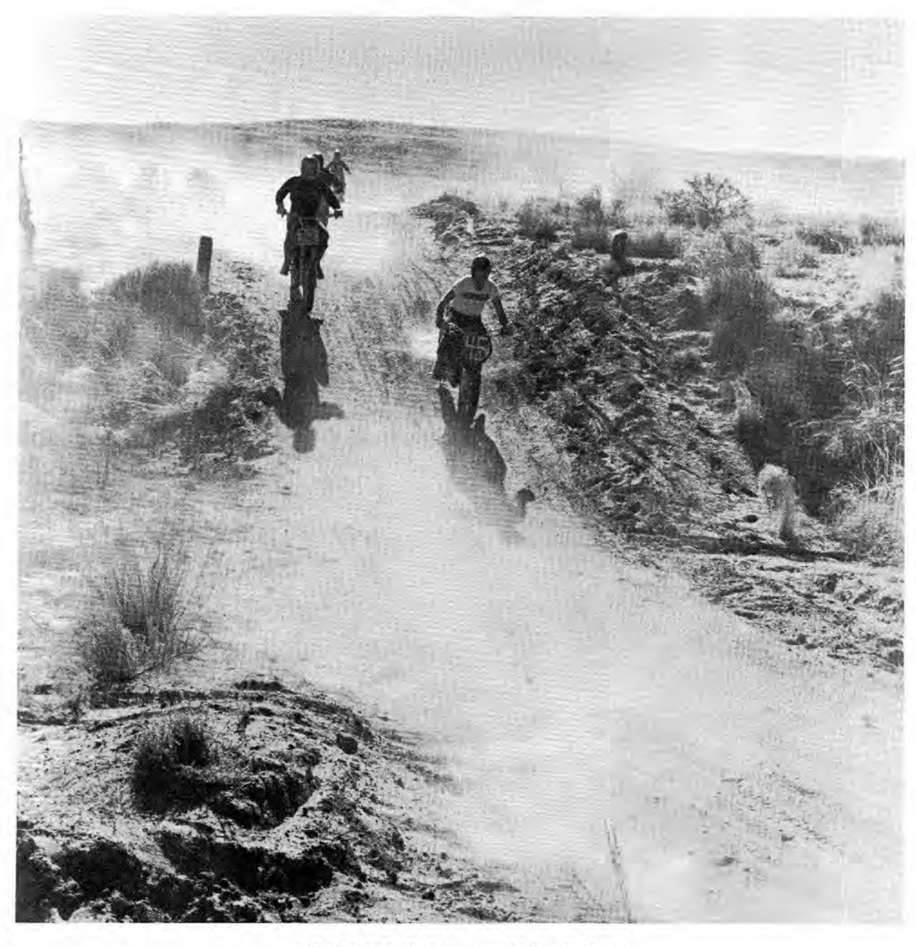
MOTORCROSS: Freeway driving it ain't.